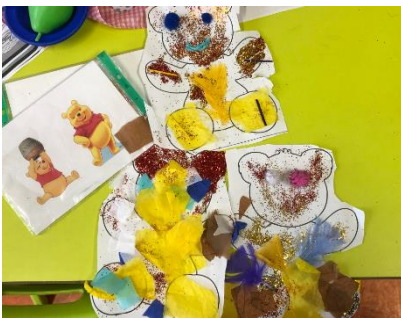
Reception took part in Winnie-the-Pooh day and brought their favourite teddy bears into school for a picnic!