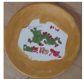
We learnt about the Chinese New Year this week and organised a workshop where the children learnt about Chinese culture.