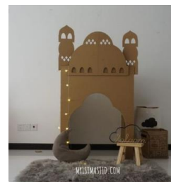
Create a Mini Eco-Mosque With Cardboard This Ramadan...