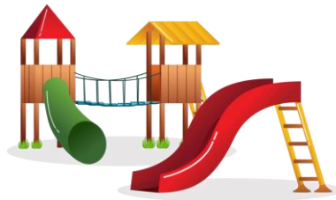
Building play areas