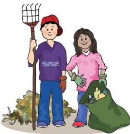
Keeping streets clean