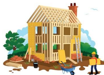
Building more houses