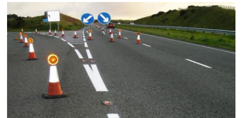
Keeping the roads in good condition