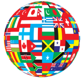
Helping people in different countries