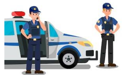
Keeping our country safe