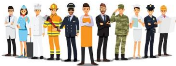
Paying nurses / doctors and teachers