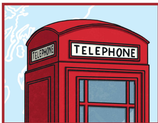
The Telephone Box